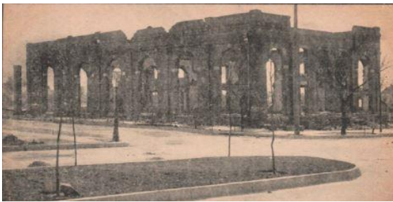
Broadway Baptist Church after the 1909 Fire

Many of the great cities of the world, including Rome, London, Lisbon, Chicago, and San Francisco have endured devastating peacetime fires. Fort Worth joined that tragic company on April 3, 1909, when a fire roared through