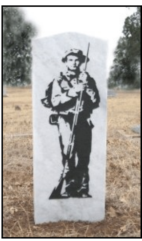
Back of George's headstone at left