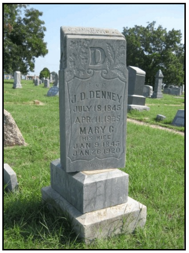
Jasper's headstone in the cemetery at Springtown