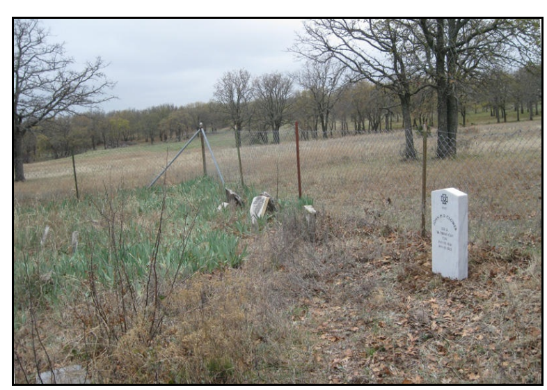
Clower Cemetery, northwest Parker County, Texas