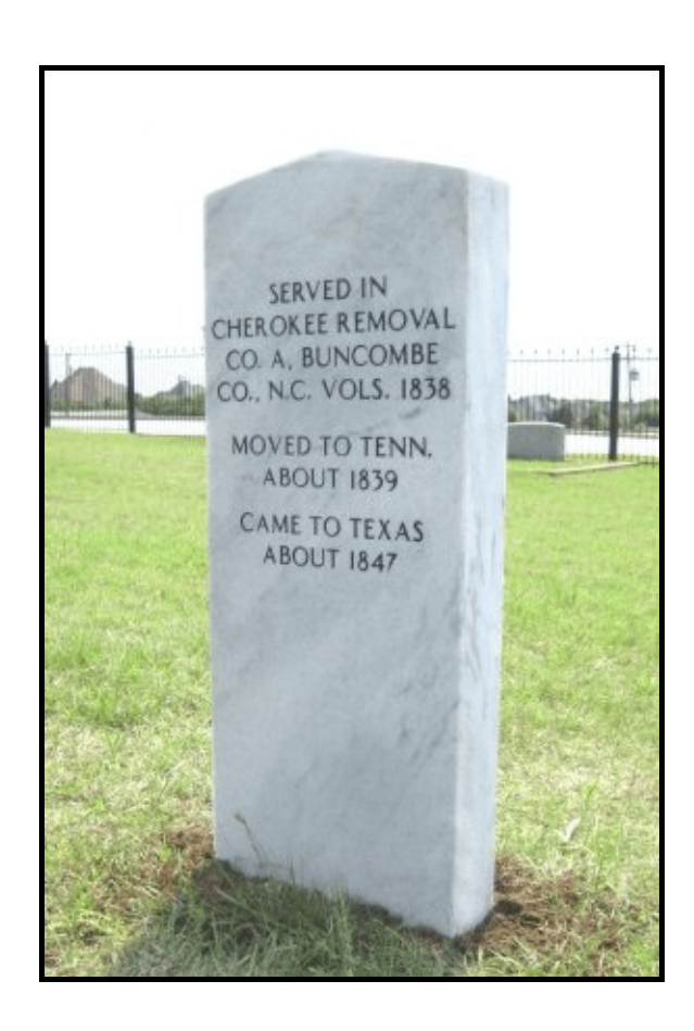
Front and back of headstone installed in White's Chapel Cemetery on Saturday, May 9, 2009.