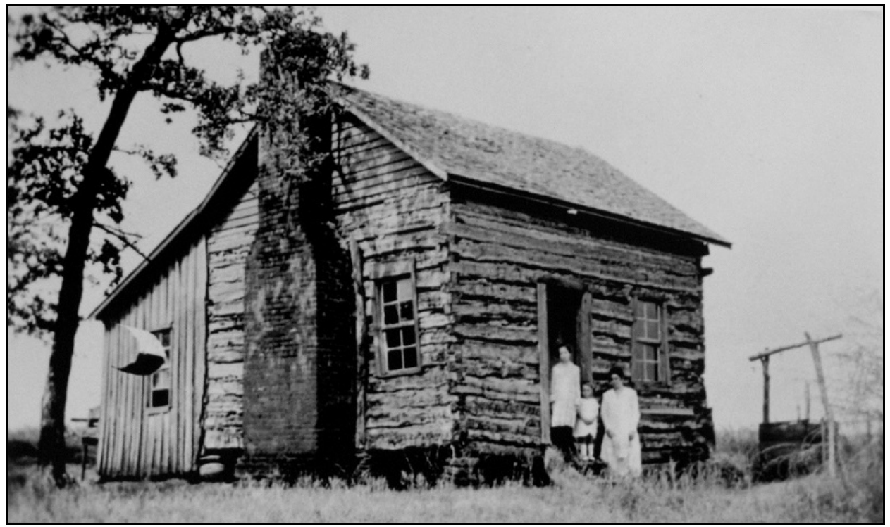
Bushong built this cabin in 1871, and lived in it until a larger house was finished nearby. The cabin still stands in Grapevine at 1617 Silverside, and, with additions, is still occupied.